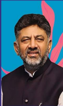
Chief Guest Shri D.K. Shivakumar Hon'ble Deputy Chief Minister Government of Karnataka