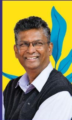
Guest of Honor: Shri. Satish Laxmanrao Jarkiholi Minister of PWD Gvt. of Karnataka